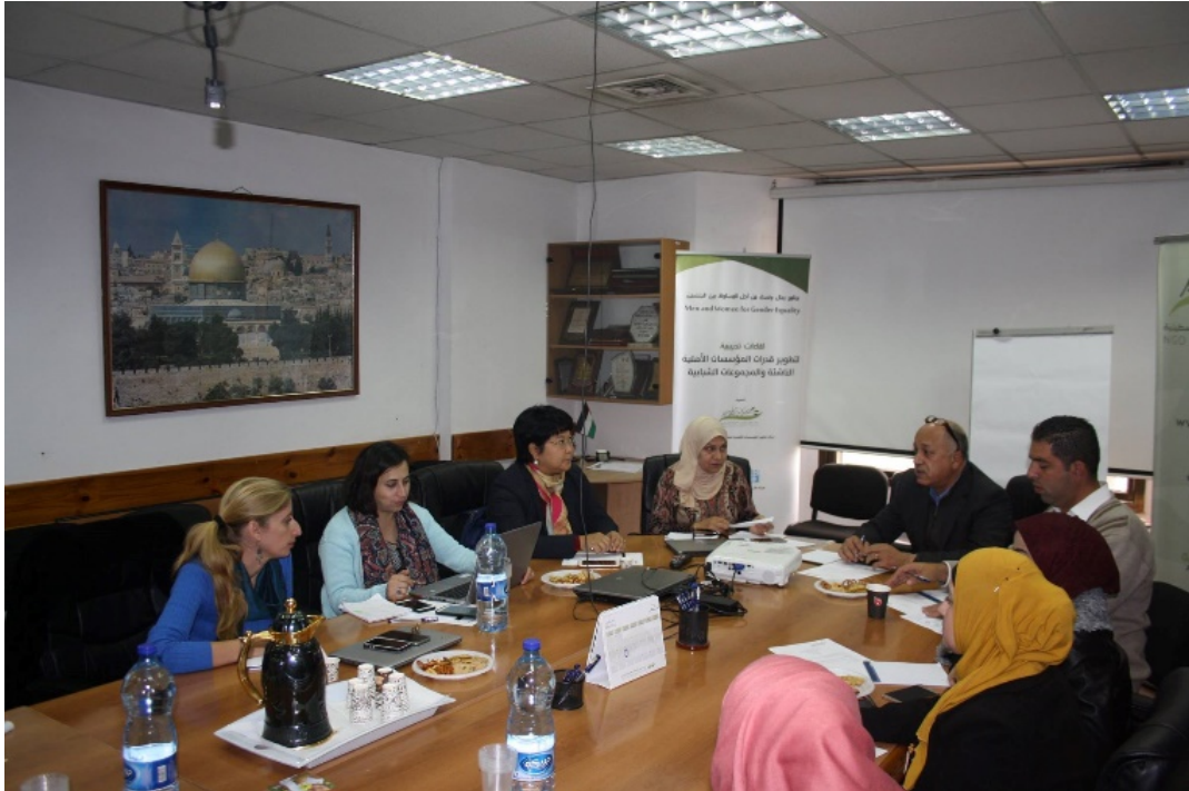
Ksabarah leading a discussion of the Foundation in a joint project with the UN and the Swedish Development Agency 2