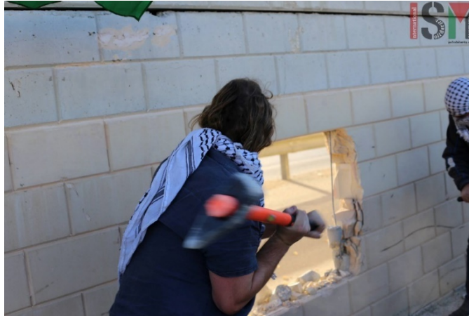
The organization's activists breakthrough a barrier wall.

Kafir Qaddum, 16 Beta and others. Over recent years, the organization has apartments intended for the volunteers in Hebron and Nablus. In the past there were also apartments in other cities.