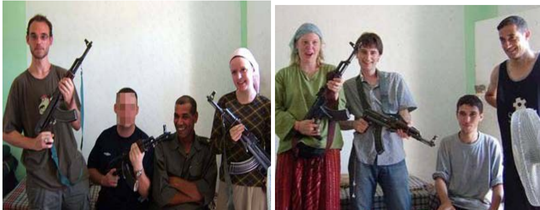
ISM activists hold weapons, photographs that the photographer, Lee Kaplan exposed.