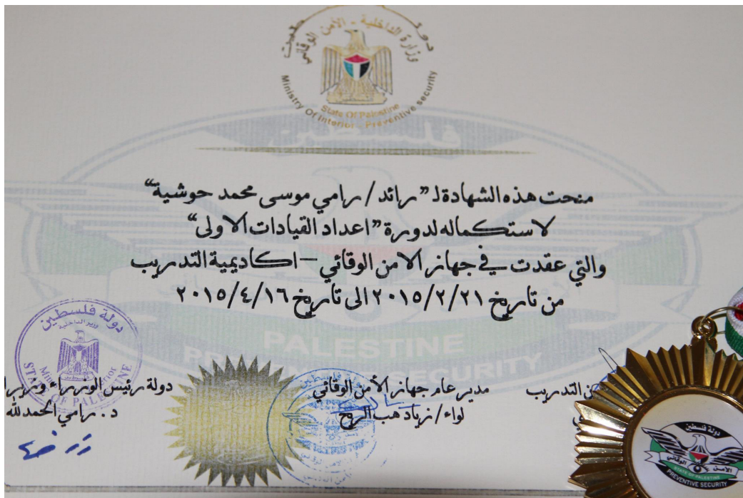
The certificate itself given over to the graduates of the Preventive Security's Commanders Course.