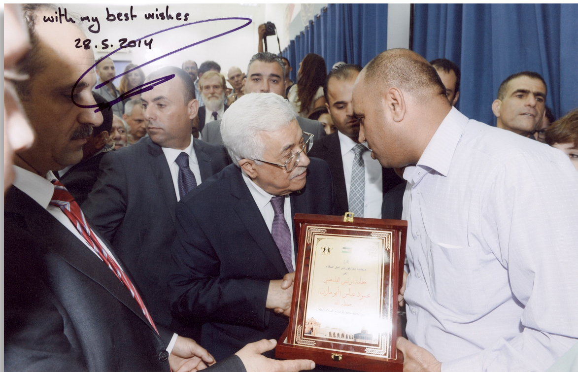
The gift given to Abu Mazen by 'Combatants for Peace'. May 2014

At the meeting in Ramallah, activists gave Abu Mazen a certificate of recognition with the organization's emblem, the PLO flag and the Temple Mount image and the al-Aqsa mosque were printed. The certificate read: "To the head of the Palestinian Authority, Mahmoud Abbas Abu Mazen, we appreciate your efforts for an equitable peace."